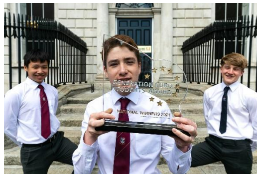
National Winners 2020/2021, Belvedere College, Dublin

Students must nominate a Team Captain who will co-ordinate the work of the team throughout the competition. The composition of the team should not change during the competition unless under exceptional circumstances, such as illness. In such cases, teams may nominate a reserve student and notify the Central Bank of Ireland.